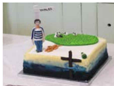
Right: The cake created as part of the farewell afternoon tea.